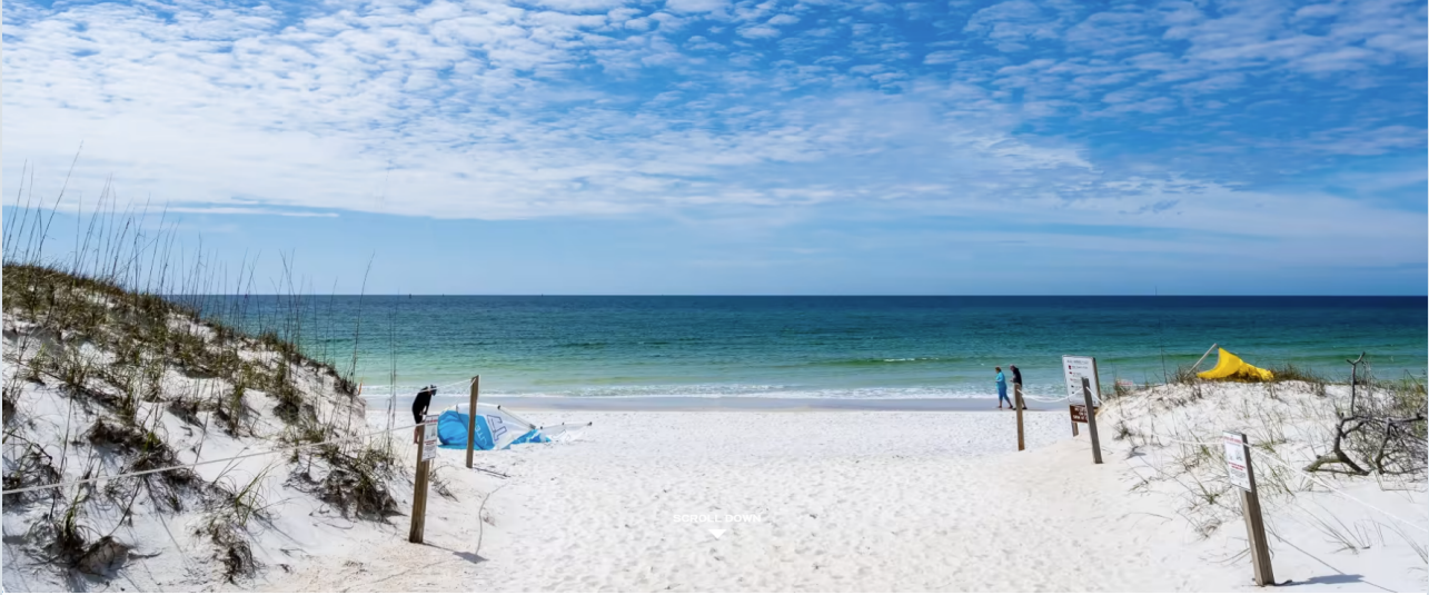
Panama City Beach